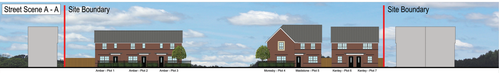
Amber - Plot 1 Amber - Plot 2 Amber - Plot 3 Moresby - Plot 4 Maidstone - Plot 5 Kenley - Plot 6 Kenley - Plot 7

WARNING TO HOUSE PURCHASERS Property Misdescriptions Act 1991 These images are intended to provide a general impression of the proposed development and are not intended to be used as a basis for any purchase decision. The images are not intended to be used as a basis for any purchase decision. The images are not intended to be used as a basis for any purchase decision. The images are not intended to be used as a basis for any purchase decision.