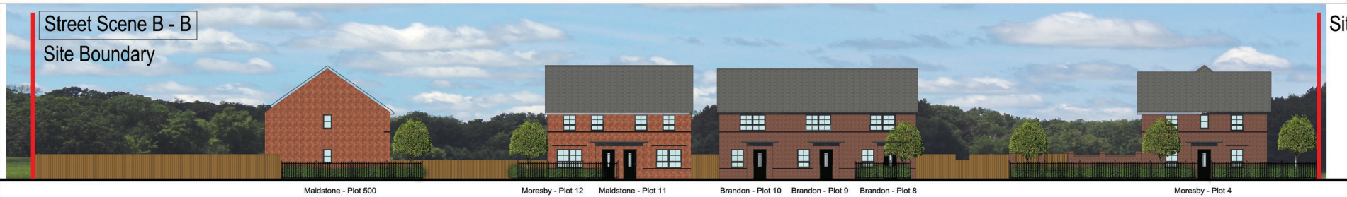
Maidstone - Plot 500 Moresby - Plot 12 Maidstone - Plot 11 Brandon - Plot 10 Brandon - Plot 9 Brandon - Plot 8 Moresby - Plot 4