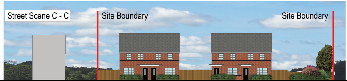
Maidstone - Plot 500 Maidstone - Plot 12 Maidstone - Plot 15 Maidstone - Plot 16